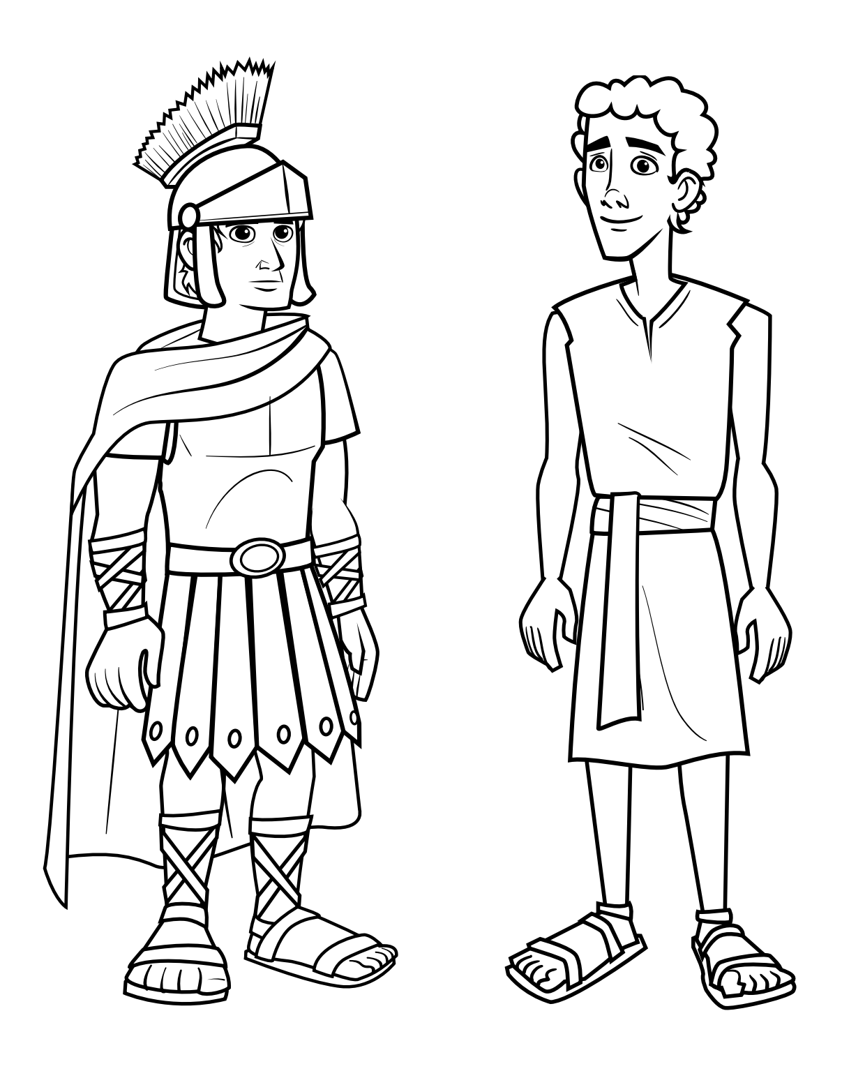
The Centurion went back home. When he got there, his servant was all better. Jesus had helped him!